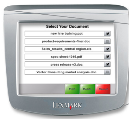
The Print Release screen for Blueprint Enterprise is accessed from the iMFP's touchscreen panel.

For a list of Lexmark MFPs that can be transformed into iMFPs with fingertip access to Pharos Blueprint Enterprise, visit www.pharos.com/Lexmark-iMFP .