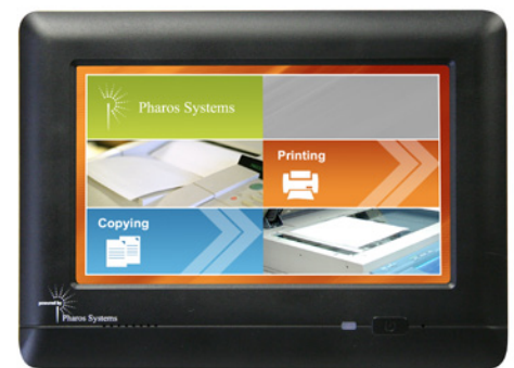
The PS200 is compatible with any kind of printer, copier, or multifunction device.

Document confidentiality is protected because Secure Release Here holds jobs until their owners authenticate themselves at the device and make their print selections. This new workflow eliminates the all-too-common sight of sensitive material lying unclaimed on top of a printer—or of people sprinting to the printer room hoping to collect their private documents before someone else reads or removes them.