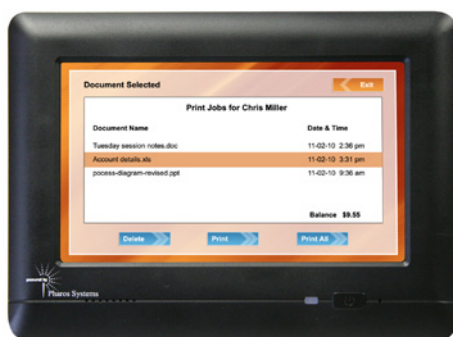
Employees use the PS200 touchscreen to select and release the jobs they need to print.

But the benefits don't end with security. The Omega PS200 and Blueprint Enterprise also make printing significantly more convenient and flexible for users while dramatically reducing waste: